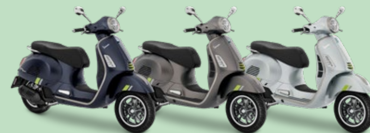
BLU ENERGICO MATT